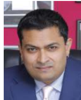
SHRI DEVRAJ SANYAL UNIVERSAL MUSIC