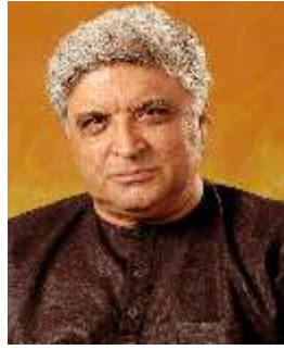
SHRI JAVED AKHTAR CHAIRMAN